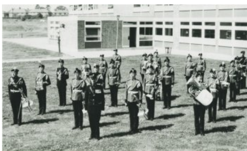
A MUSICIAN NOT A GARDENER My Life in an Infantry Line Band 1963 to 1975